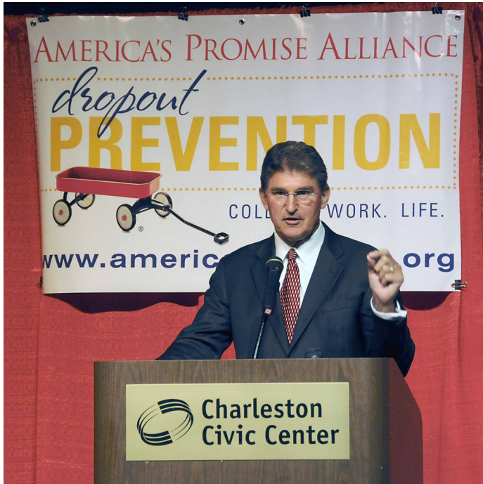
Governor Joe Manchin III

“Education is a lifeline to everything that we do. A third of the country’s population is made up of children, but 100% of our future depends on them. We can’t afford to lose one-not one. We have to figure out how we can challenge them, how we can make education interesting to them.”